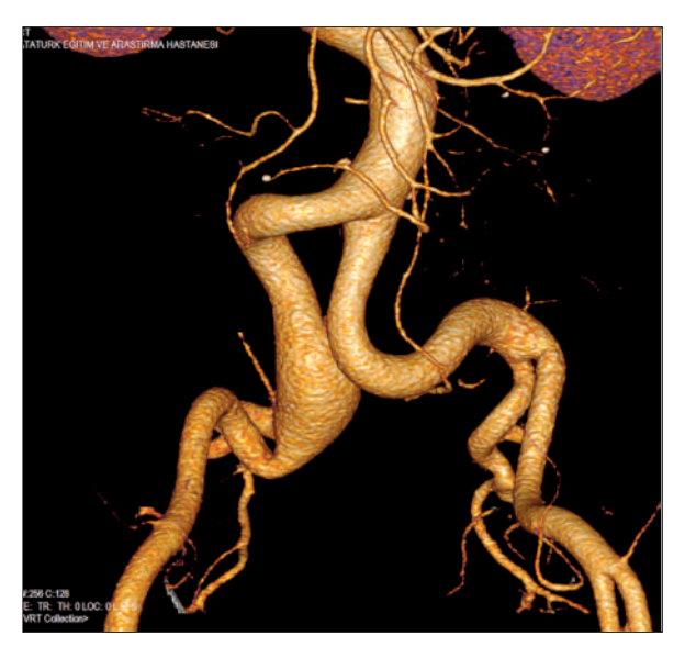
FIGURE 1: 3-D reformatted computerized tomographic angiography image shows isolated fusiform right common iliac artery aneurysm extending to the iliac bifurcation and excessive angulation of the iliac arteries.

Bilateral common femoral arteries were surgically prepared under general anesthesia. Systemic anticoagulation was achieved with an intravenous bolus dose of 5,000 IU heparin. Subsequently, 6 Fr short sheaths were placed into both femoral arteries. Standard 0.035-inch guidewire was advanced inside the 5Fr Bern catheter, passing through the aneurysmatic segment via the right femoral artery and 0.035-inch extra stiff guide wire (Lunderquist; Cook Inc., Bloomington, IN, ABD) was inserted through the catheter after withdrawing the standard guidewire. Over the stiff guidewire, the tip of Zenith® iliac branched endograft (Cook Inc.,