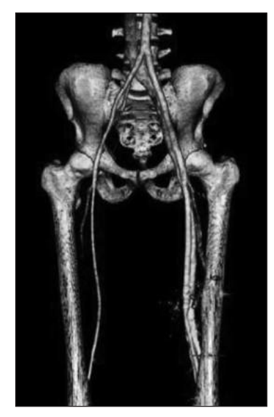
FIGURE 1: 3 dimensional computed tomographic view of fistula.

An interventional approach as closing the defect with a covered stent was planed and procedure